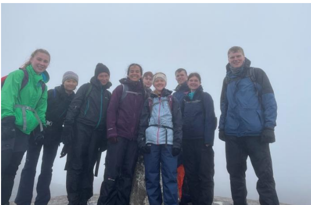
Ben Nevis summit

Fortunately, we could see the forecast set to improve by the Sunday, so we ran the event route in opposite direction to our normal weekend and started the challenge in Snowdon on the Saturday morning where the conditions were more pleasant. The corridor route from Seathwaite to the summit of Scafell Pike and back was taken on a little earlier in the night and with slightly fresher legs than normal due to less walking time earlier in the day. That left the final Ben Nevis summit for the Sunday morning and fortunately the weather was much improved compared to the previous day. The Ben though certainly made for a hard finish to the event having to take on the longest walk and highest mountain at the end of the weekend instead of the start but fortunately all students managed to complete the challenge and filled with pride with what they had achieved. Hopefully they won't stop there and will be walking in the hills for many years to come.