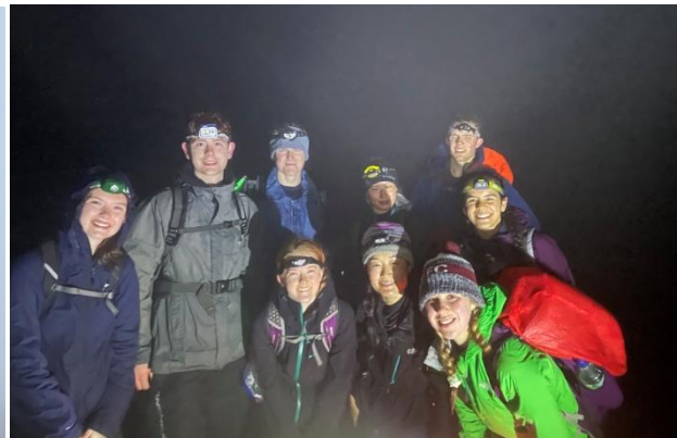
Scafell summit - middle of the night