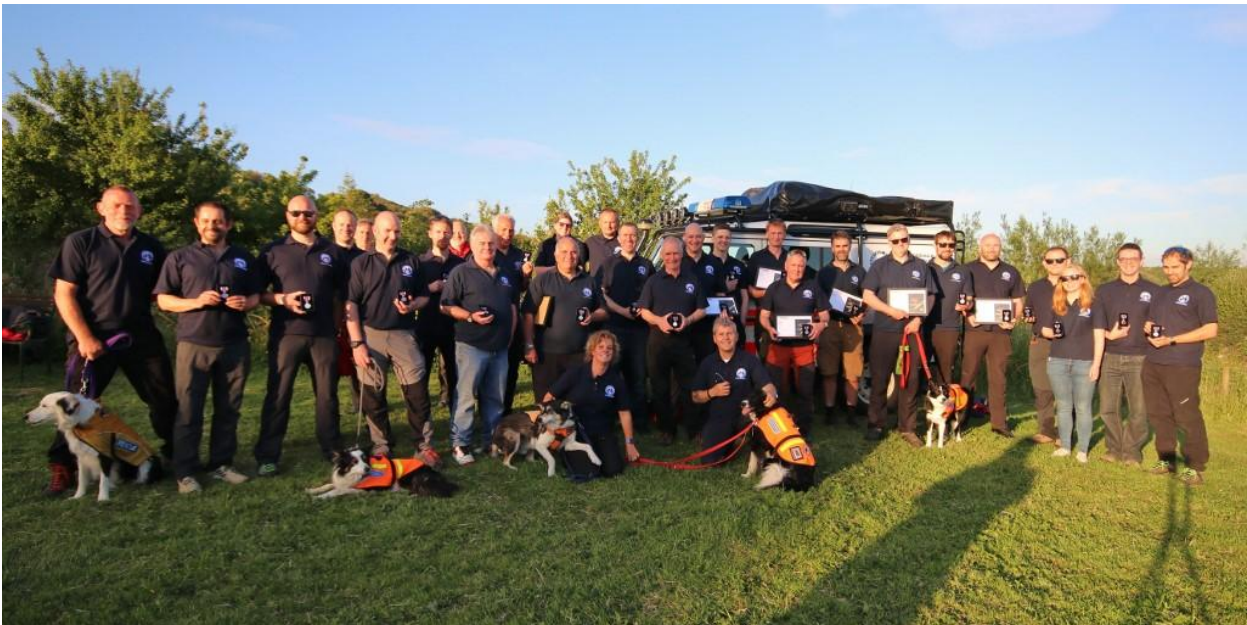
Team members proudly show off their awards