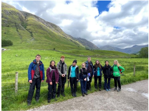
3 Peaks successfully completed

This July also saw the team take part in a special one off event in partnership with the Durham University Hill Walking Society who were celebrating their 70 th anniversary and wanted to take on an All Wainwrights challenge. The Wainwrights are the 214 hills and mountains in the Lake District that Alfred Wainwright wrote about in his guides of the Lakeland Fells.