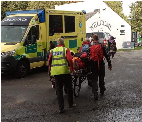
High Force - casualty to awaiting ambulance