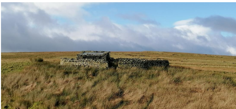
Location of second casualty site

In the scenario one of the couple takes a fall and severely injures her leg. This will be 'reported' on a 999 call at 18:00, which will be relayed to the Team (by me). From this point the incident is now running 'live'. During the rescue it will be revealed that a third person, the game keeper, should have arrived. Information from the casualties, and another informant, give details of his last known location and his possible route. It is now known that there is another casualty out on the moor. It will be for the Search Managers to quickly devise a search strategy.