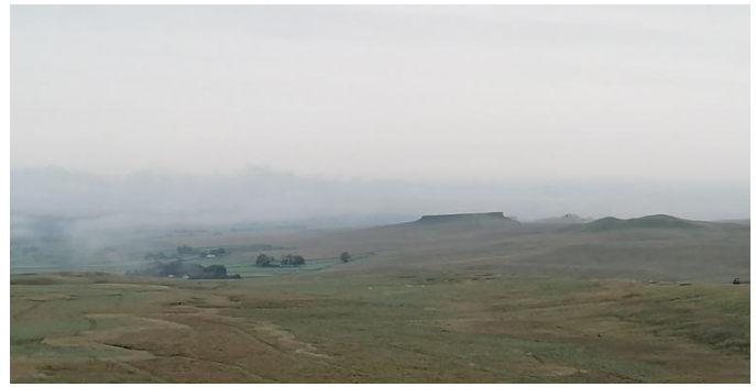
Looking back to Goldsborough

Typically a night exercise starts at nightfall, around 18:00, and lasts between 5 and 6 hours. The exercise scenario needs to keep as many members of the team as possible engaged for the whole of this period and in this case, we also wanted the dogs to play their part.