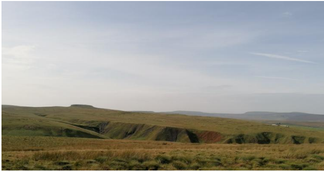
Looking across 'out of bounds' to Shacklesborough