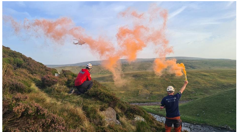
Directing helicopter to casualty site at Cauldron Snout