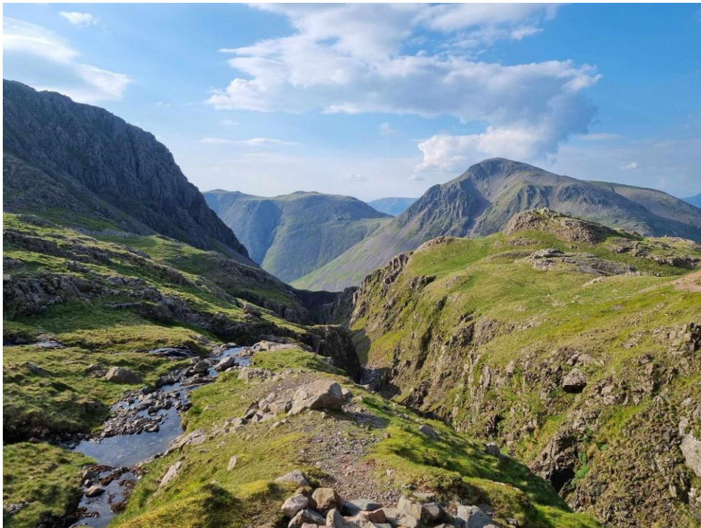
The top of Piers Gill

We reached the top of Scafell Pike and after a lunch break, we started our descent towards Broad Crag. We had not gone far when we received a call from Wasdale Mountain Rescue Team saying that they had a call out for a casualty with a lower leg injury on the corridor route near the top of Piers Gill, and could we assist. We certainly could assist, and we reached the incident site in about 10 minutes. Our medics assessed the casualty and made her comfortable and then we waited for Wasdale team members to arrive with a stretcher and other equipment. Fortunately, the weather stayed good.