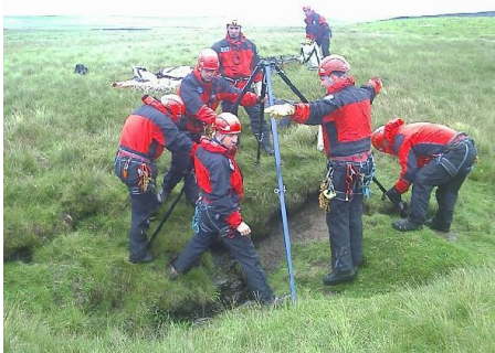
Technical Rescue Group , practice shaft rescues using a quad pod